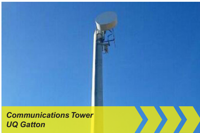
Communications Tower UQ Gatton