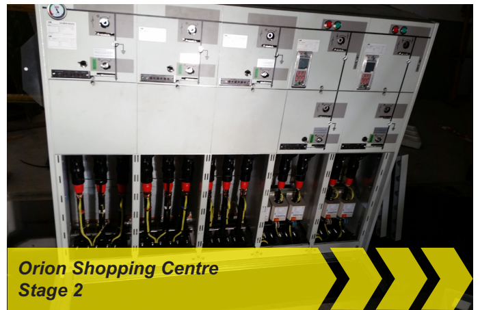
Orion Shopping Centre Stage 2