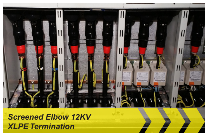
Screened Elbow 12KV XLPE Termination

Construction of lightning protection systems to Australian and international standards with ongoing testing and maintenance programs. Surge diverter installation of HV and LV switchboards to add to a complete over voltage protection capability to your electrical system.