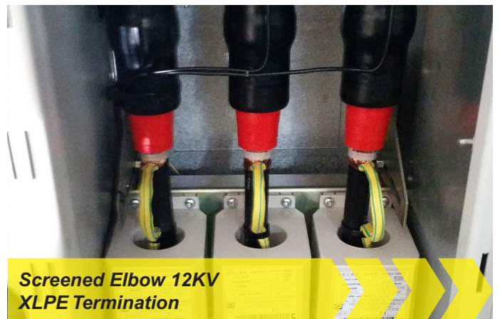
Screened Elbow 12KV XLPE Termination

Protection relay programming with Primary and Secondary injection testing, as part of construction and maintenance of substation protection systems. Rolray Electrical also specialises in self powered relay harmonic and reliability issues.